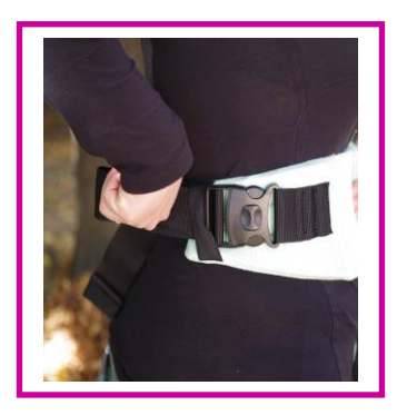
Place the waist belt on your belt. Pull the buckle through the safety rubber band, fasten the buckle and secure the safety lock and tight the belt. Don't underestimate this triple safety system!